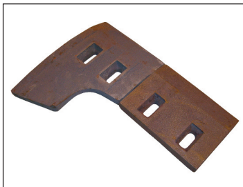
Heat treated cast steel for extra durability