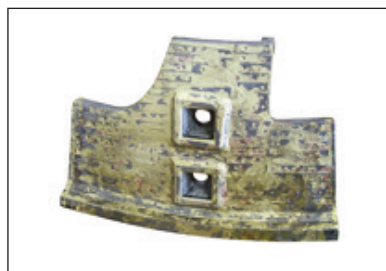
ConSpareUltra central blade with tungsten carbide tiles