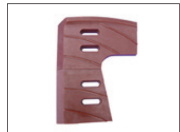
Hawiflex synthetic rubber with raised ribs to aid mixing